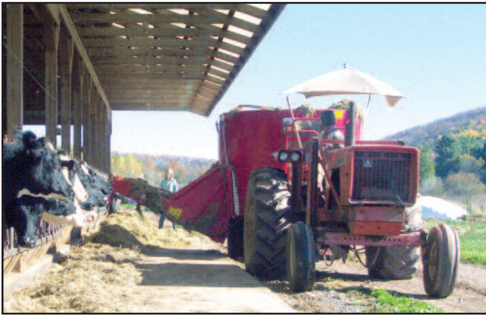
The Precision Feed Management Program encourages farmers to grow more of their own feed.

Dairy farms usually create feed by mixing commercially purchased feed with their own home grown crop. Commercial feed is supplemented with high levels of vitamins and minerals, including phosphorous. The program is showing dairy farmers how to create more balanced blends that contain less phosphorous.