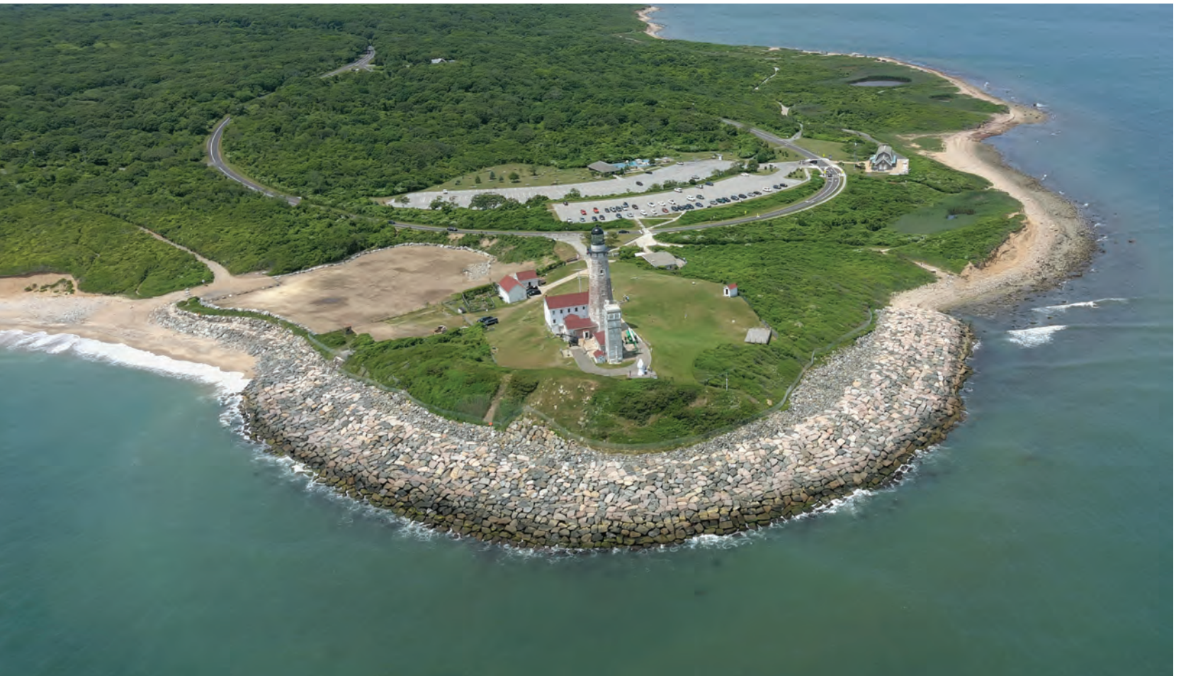
Aerial image of the Montauk Point Coastal Resiliency Project.