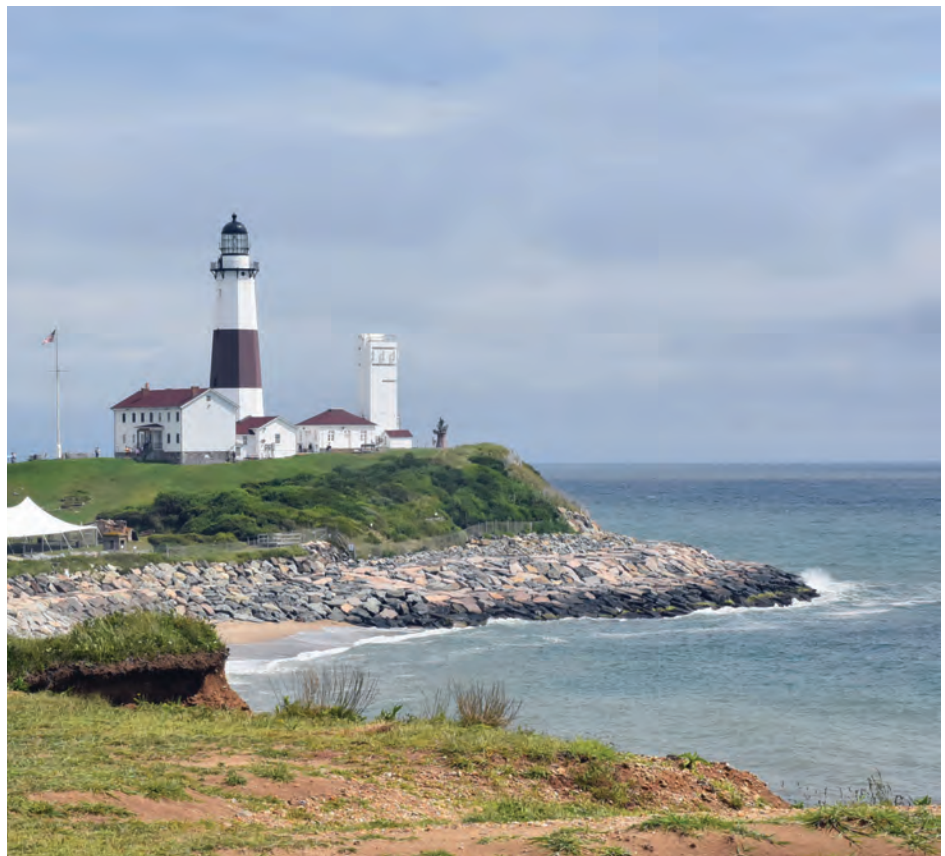
The stabilized cliffs after the completion of the Montauk Point Coastal Resiliency Project in 2023.