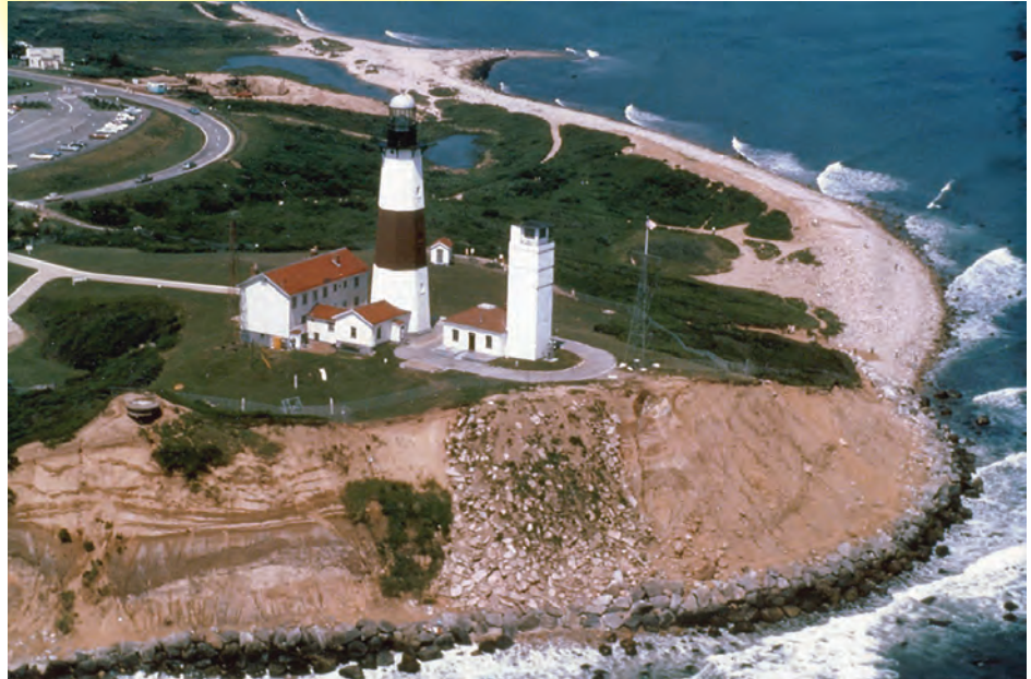
The eroded cliffs at the Montauk Point Lighthouse in 1968.

The 111-foot-tall octagonal beacon sits on Turtle Hill that has cliffs that cascade into the ocean on the east and south sides of the structure. The lighthouse is white with a broad red band sitting across its middle