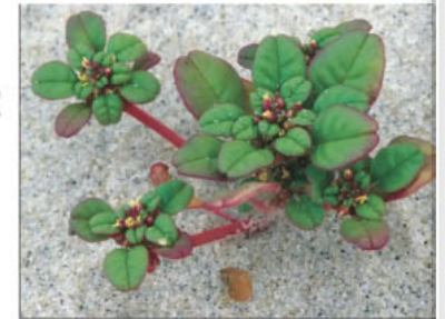
Seabeach amaranth ( Amaranthus pumilus )

The plant is listed as threatened under the federal Endangered Species Act and as endangered by the State of New Jersey.