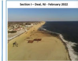
Section I – Deal, NJ - February 2022