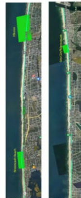
FY22-24 Renourishment locations

"If Madara wasn't monitoring the beach in 2000, the Seabeach Amaranth wouldn't have been discovered"