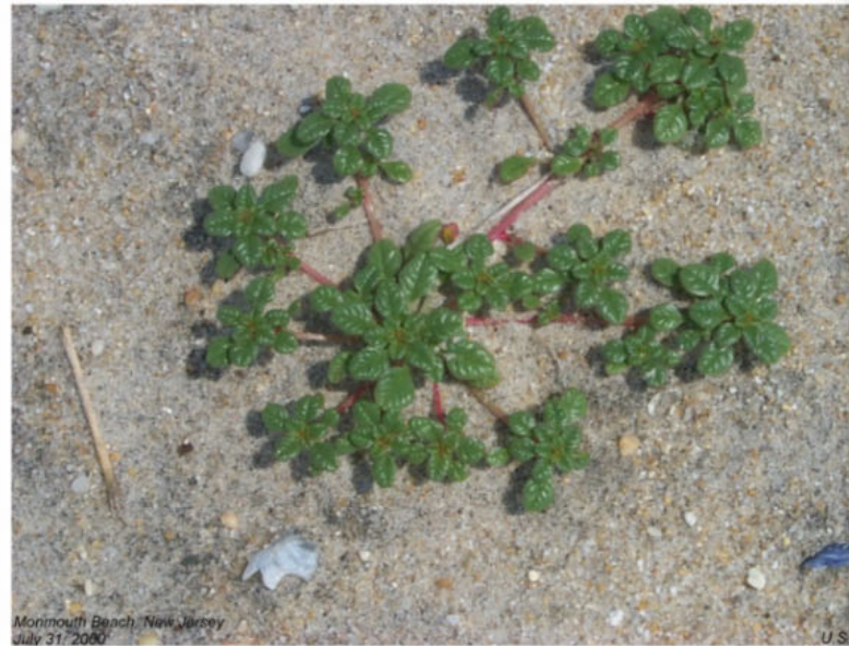
Monmouth Beach, New Jersey July 31, 2000